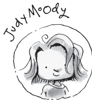
Bookworm, speed-reader (NOT!), and quizzard

At the beginning of the book are illustrations and short biographies of major characters. Have your students create their own Who's Who pictures and bios of their family, friends, teammates, and/or classmates. Go over the format of the Who's Who pages in Judy Moody, Book Quiz Whiz with your class to point out the quirky, intricate illustrations and the short, to-the-point descriptions to inspire them. Invite students to share their creations with the class.