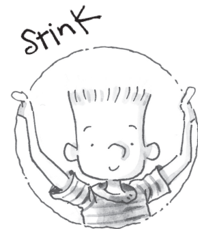
Bookworm and Super Sticky-Note Man